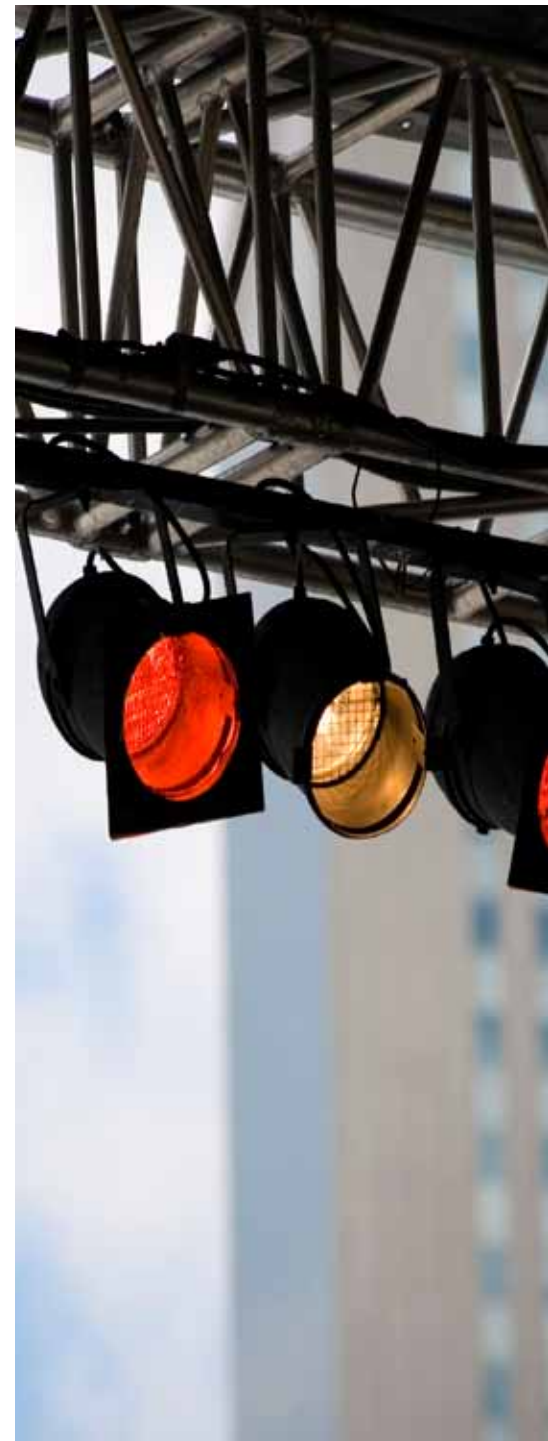
Deep-dyed films are used in theatrical lighting applications.

Nearly 60 years ago, Solutia's Performance Films Division pioneered deep-dyed film technology. Today, we continue our tradition of innovation by providing the industry's most comprehensive selection of dyed and colored films utilizing both water and solvent based processes.